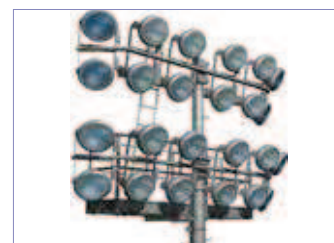
PFD30 - two 4800 bent crossarms 2.7m ladder - distance between rows 1.6m - 24 floodlights maxi

Electricity cables come out either from a head cap (4 or 8 cable gland models) or either from Ø 101 mm steel tubes on crossarm level.