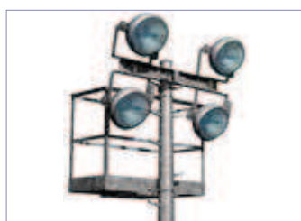
PFD15 - one 1550 crossarm 4 floodlights maxi

Based on these elements, there are 7 different possible configurations: