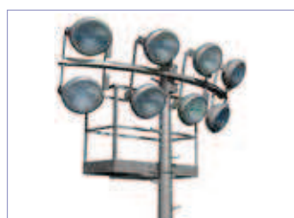
PFD15 - one 3000 curved crossarm - 8 floodlights maxi