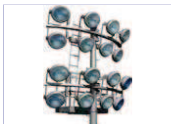
PFD15 - two 3000 curved crossarms 2.7m ladder- distance between rows 1.6m - 16 floodlights maxi