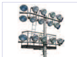
PFD30 - two 4800 bent crossarms 2.7m ladder - distance between rows 2m - 18 floodlights maxi