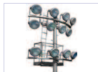
PFD15 - two 3000 curved crossarms 2.7m ladder- distance between rows 2m- 12 floodlights maxi