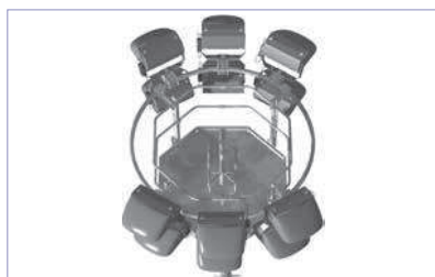
PFC15/12 with 6 sitting and 6 hanging floodlights on two sides.