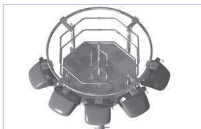
PFC15/12 with 5 hanging floodlights on a single-side