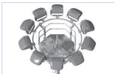
PFC15/12 with 10 sitting floodlights 360° arrangement