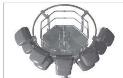
PFC15/12 with 5 sitting and 5 hanging floodlights on a single-side