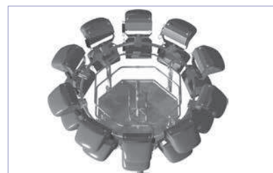
PFC15/12 with 10 sitting and 10 hanging floodlights - 360° arrangement